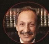
Mark Geragos, Esq. Los Angeles