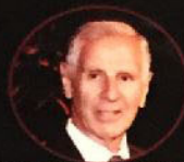
Gov. George Deukmejian